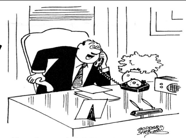
"Can you keep me on hold a little longer? I'm enjoying the music."

Keeping attention on this important topic is key. Post signs, dedicate a safety meeting to the subject — do whatever you can to let your employees know that mobile devices can be a threat to the safety of everyone on the site. ■