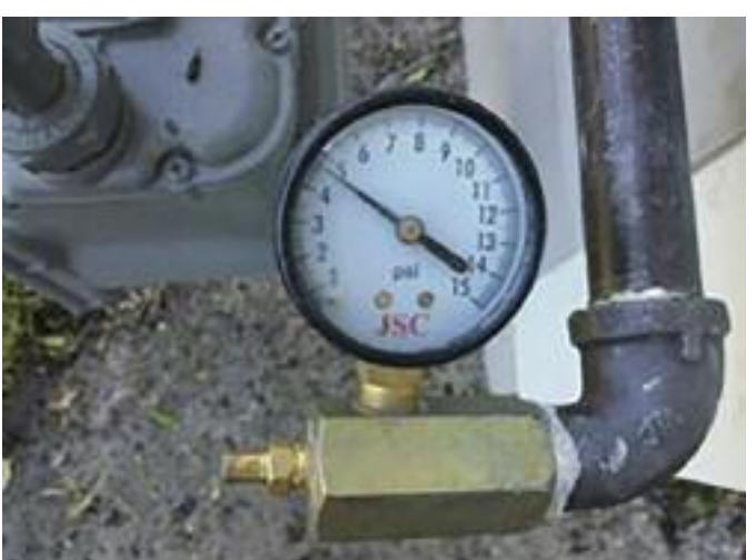
406.3.3 Appliance and equipment disconnection. Where the piping system is connected to appliances or equipment designed for operating